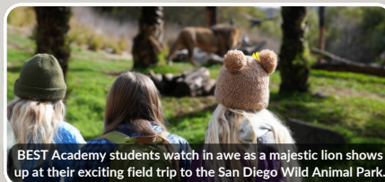
BEST Academy students watch in awe as a majestic lion shows up at their exciting field trip to the San Diego Wild Animal Park.