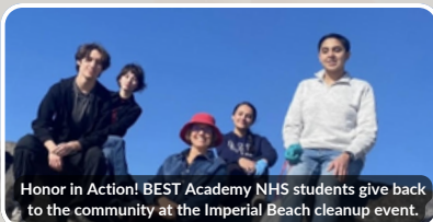
Honor in Action! BEST Academy NHS students give back to the community at the Imperial Beach cleanup event.

Click here to check out the books and resources we have available.